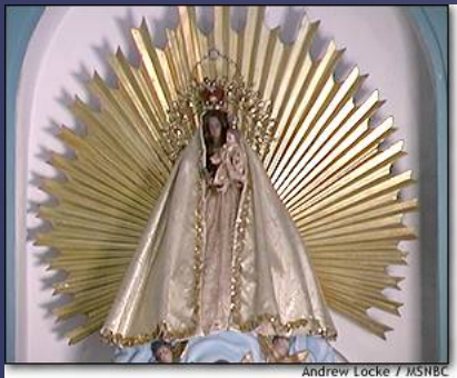
Oshun/Our Lady of Charity