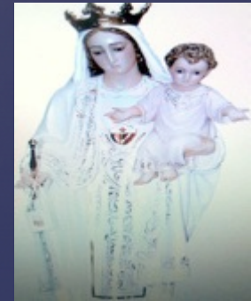
Obatala/ Our Lady of Mercy