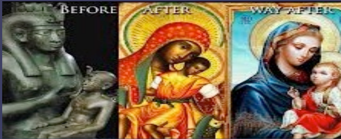
Isis and Horus