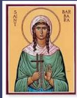
Shango/ Santa Barbara